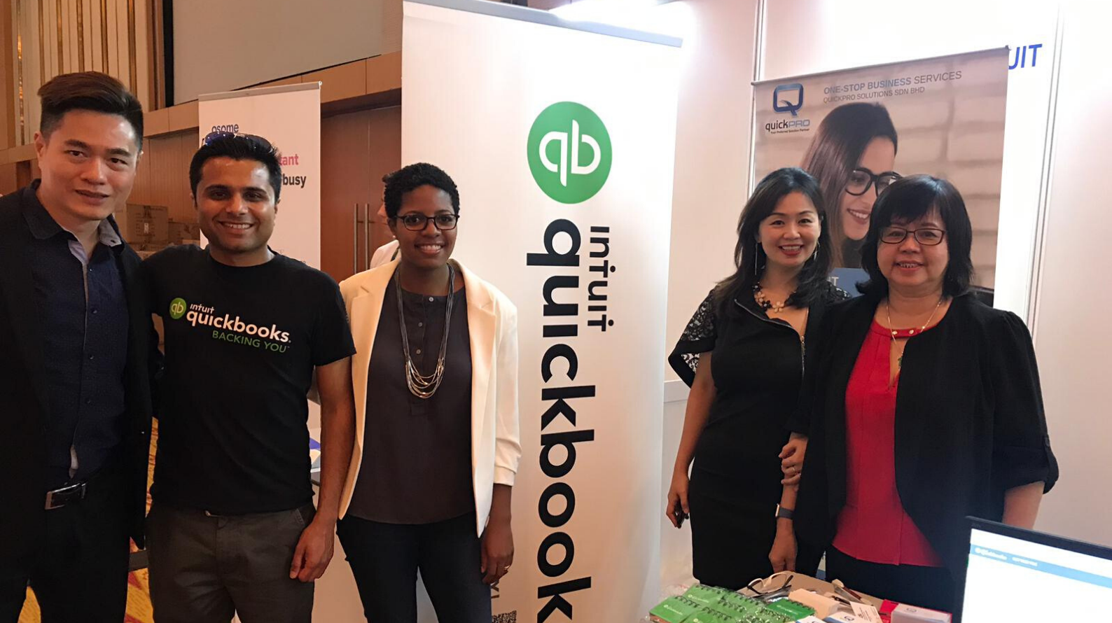
Picture taken at QuickPro Solutions's Booth in Malaysia International Accountants Conference 2019 (21-23 October 2019) @ KLCC